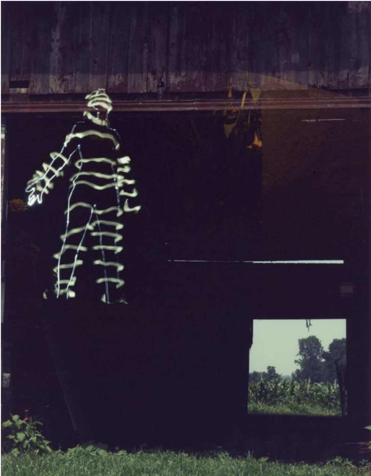
Chromogenic Print 8"x 10"