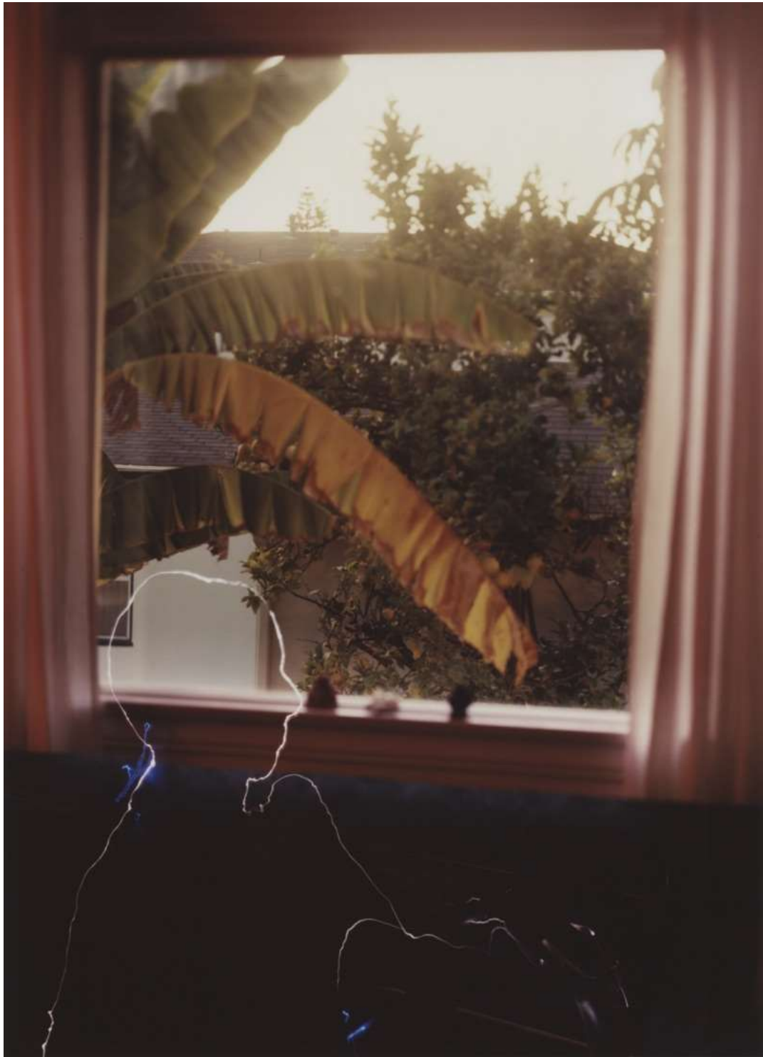
Chromogenic Print 8" x 10"