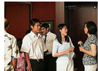
Intergenerational exchange is part of the IGM Art Gallery mission