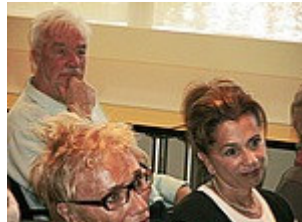
Plato's "Forms" frame Blair's lecture - is "art" worthwhile?