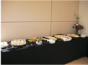
Refreshments provided by USC Dept. of Otolaryngology, flowers and set up by IGM Art Gallery