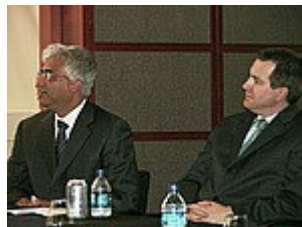
Doctors enjoying good entertainment