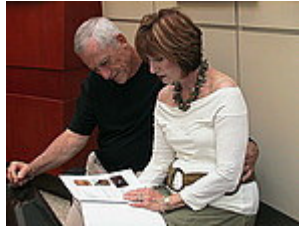
Gallery Book enthralles readers