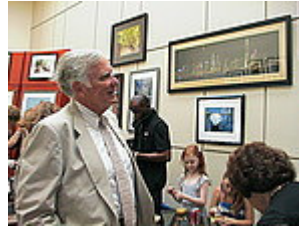
The mission of the USC IGM Art Gallery is to serve as an art-framed forum for open minded discussion for all ages and points of view