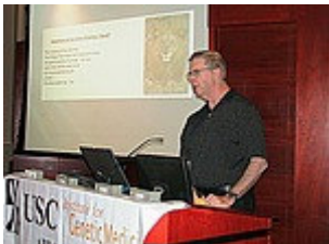
The Story of the Dread encapsulated by poetry and images