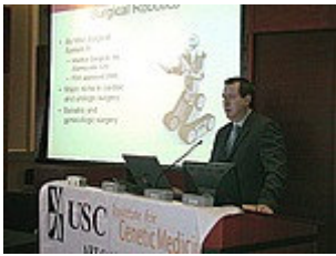
Transoral Robotic Surgery, TORS, is a new, minimally invasive technique that allows treatment of many head and neck tumors without traditional "open approaches" and their associated morbidity