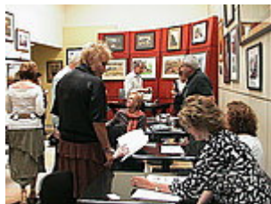
The exhibit brings guests together for conversation