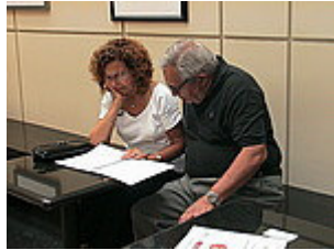
Guests read the "Gallery book"