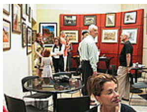
A proud Victor (photographer) stands ready to answer inquiries