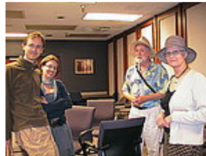
Other members of the Global Health Forum Steering Committee