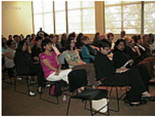
Call to Assembly