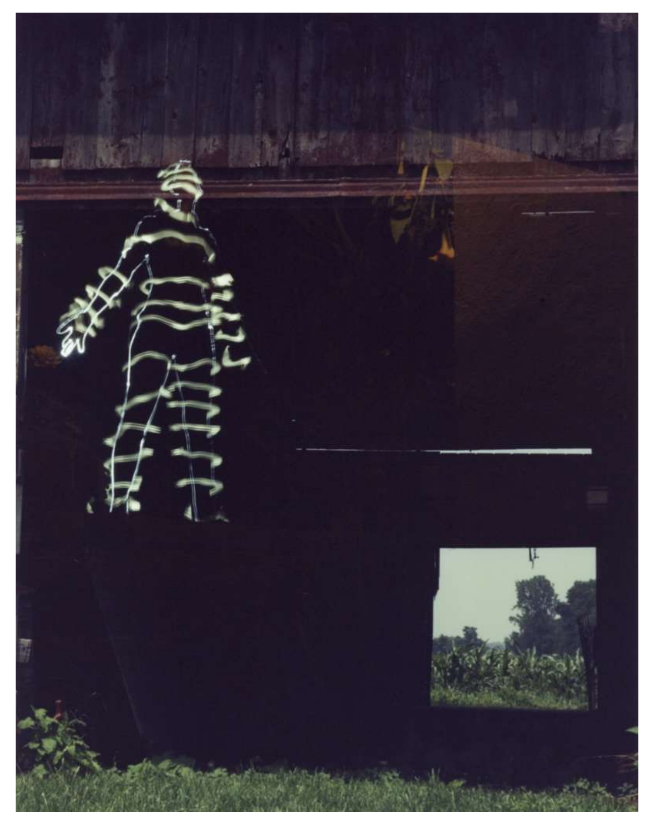
Chromogenic Print 8"x 10" Elsewhere Susan Sims Hillbrand